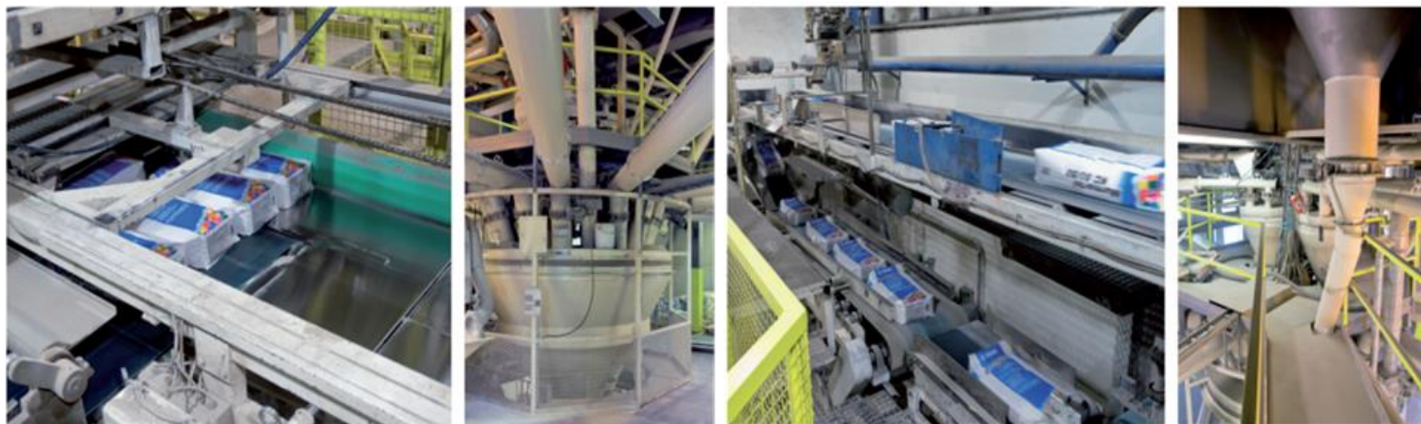
Figure 1: production process detail

The production process starts from raw materials, that are purchased from external and intercompany suppliers and stored in the plant. Bulk raw materials are stored in specific silos and added automatically in the production mixer, according to the formula of the product. Other raw materials, supplied in bags, big bags or tanks, are stored in the warehouse and added automatically or manually in the mixer. The production is a discontinuous process, in which all the components are mechanically mixed in batches. The semi-finished product is then packaged, put on wooden pallets and stored in the finished products warehouse. The quality of final products is controlled before the sale.