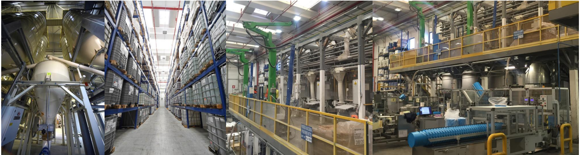
Figure 1: production process detail

The production process starts from raw materials, that are purchased from external and intercompany suppliers and stored in the plant. Bulk raw materials are stored in specific silos and added automatically in the production mixer, according to the formula of the product. Other raw materials, supplied in bags, big bags or tanks, are stored in the warehouse and added automatically or manually in the mixer. The production is a discontinuous process, in which all the components are mechanically mixed in batches. The semi-finished product is then packaged, put on wooden pallets and stored in the finished products warehouse. The quality of final products is controlled before the sale.